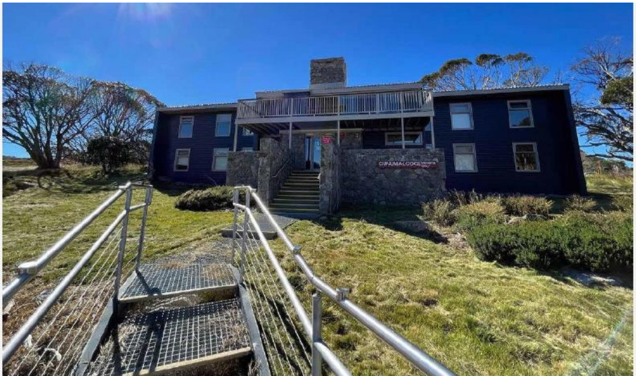
Figure 3 | View of Gunuma Lodge from the western elevation