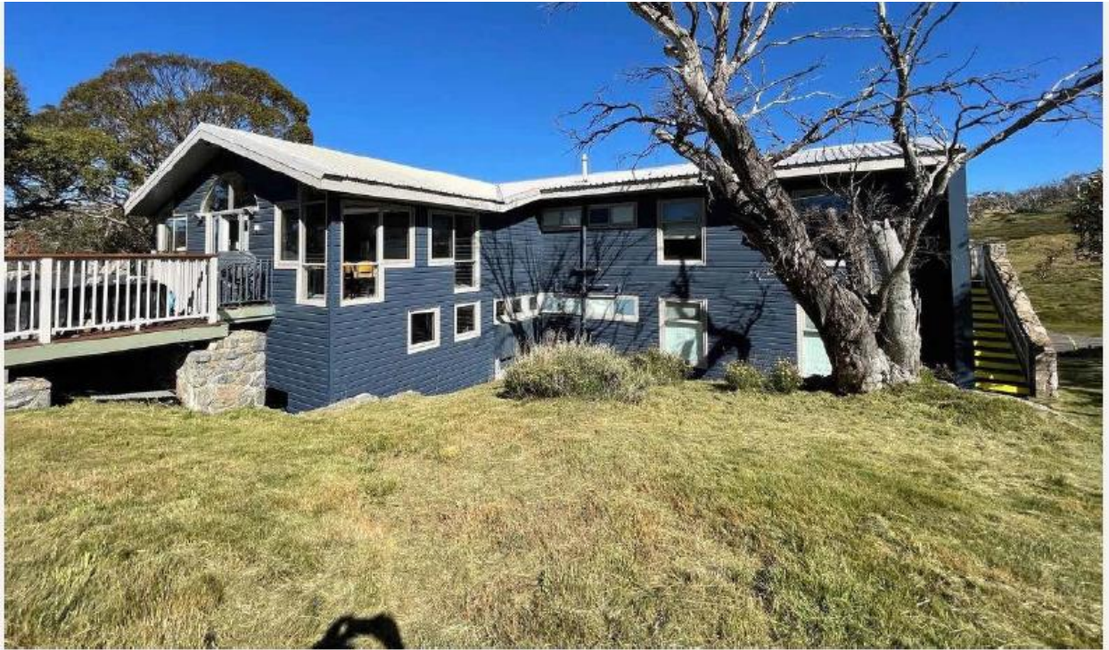
Figure 2 | View of Gunuma Lodge from the eastern elevation