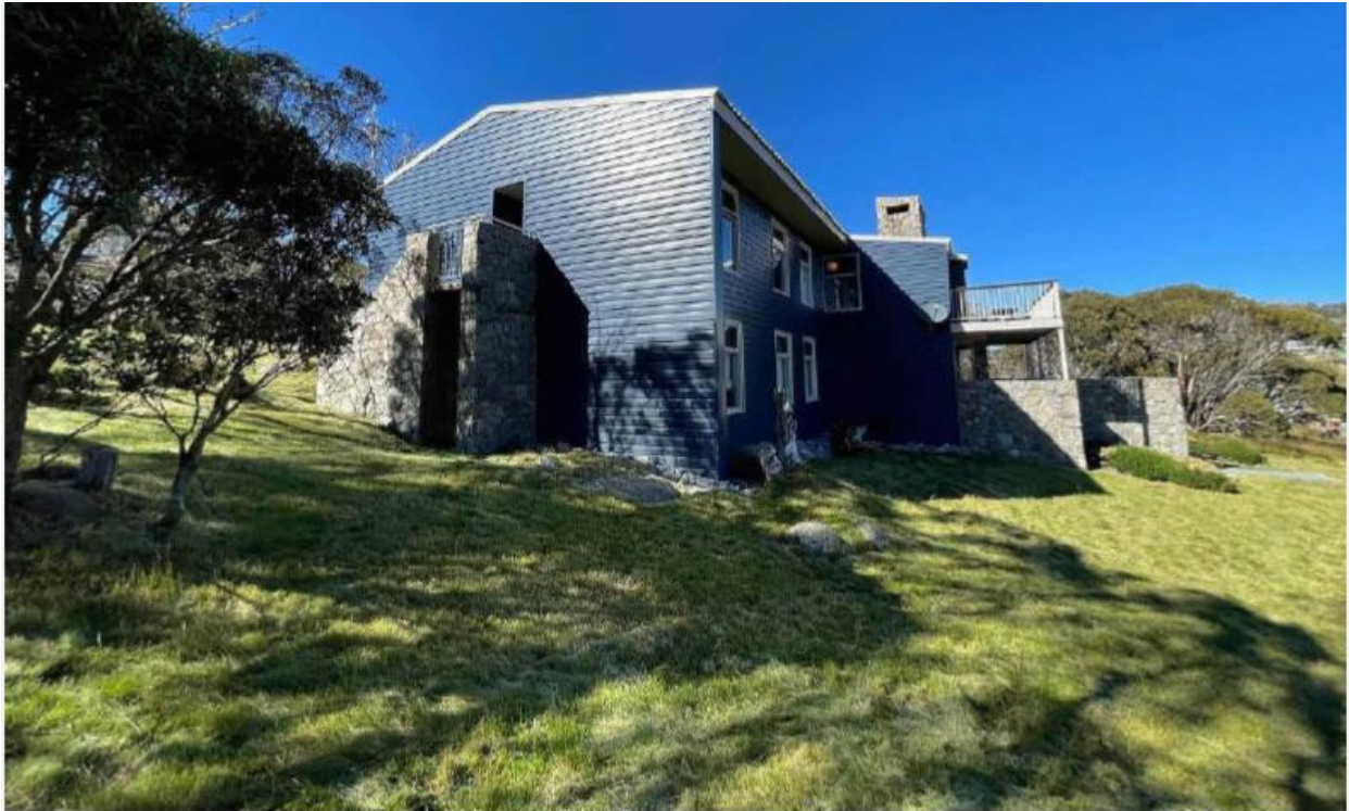
Figure 4 | View of Gunuma Lodge from the northern elevation

This application proposes to remove and replace all 60 windows and doors that are outward facing in the lodge (excluding the solid core doors that access the fire stairs at each end of the lodge bedroom corridors). The internal and external colour of any window frames will be matched as closely as possible to the existing Colorbond Dune. All window glazing will be double glazed with high solar transmission and BAL rated to 40.